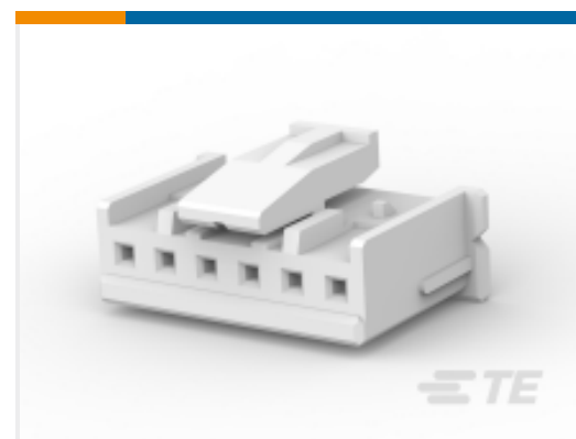
TE Part # 1744417-6 6 POS EP 2.5 HSG, GLOW WIRE