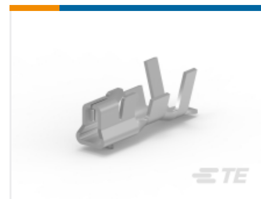
TE Part # 2232983-1 EP 2.5 LIF RCPT CONTACT, 24-20 AWG