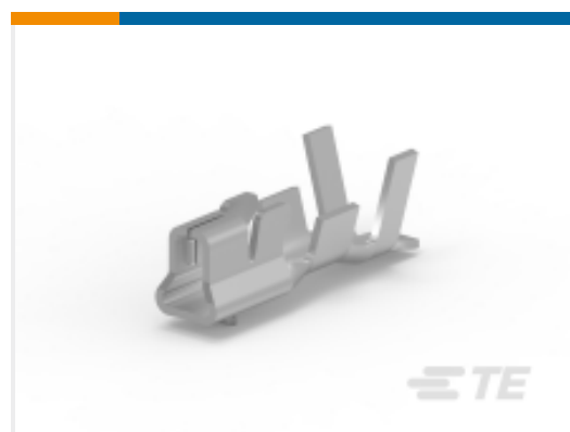
TE Part # 2232905-1 EP 2.5 LIF RCPT CONTACT, 26-22 AWG