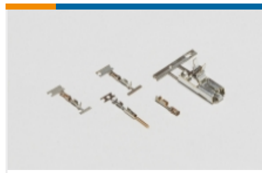
Wire-to-Board Connector Contacts(6)